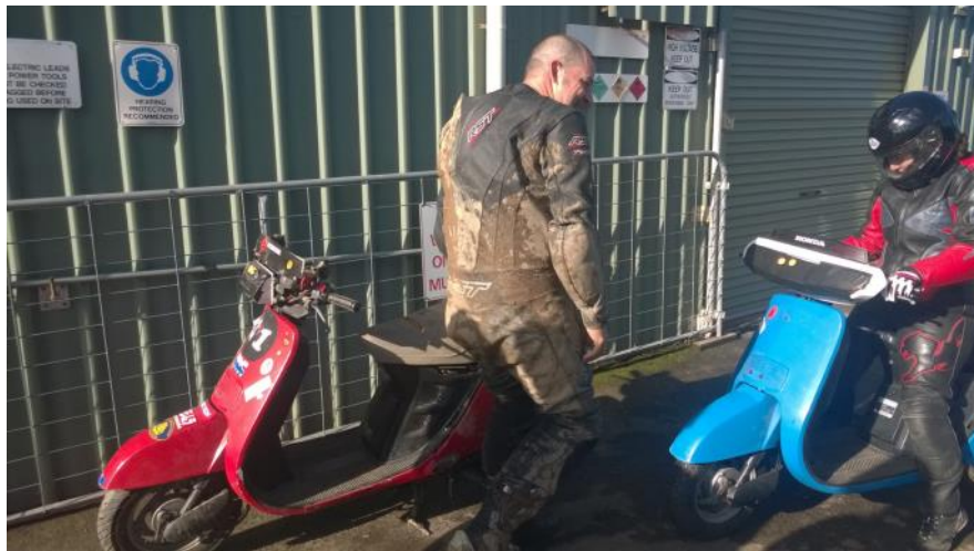
Someone's leathers need a bit of a clean...