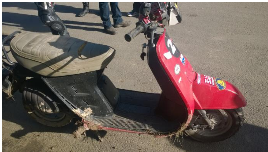
This Honda Lead didn't end up in the lead...